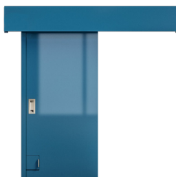
OPTION EXAMPLE Hose port